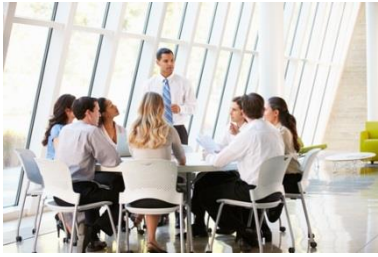
1. Meeting the Customer/ Intro to the challenges.