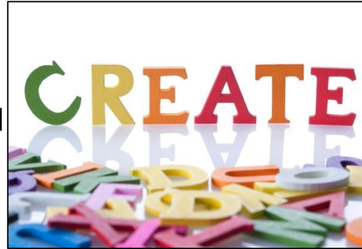
6. Finding Ideas to meet the challenge.