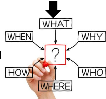
5. Shaping the Challenge.