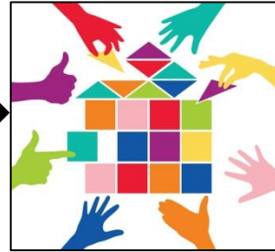
3. Team building.