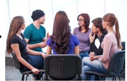
4. 'I' leaders, adapters and innovators.