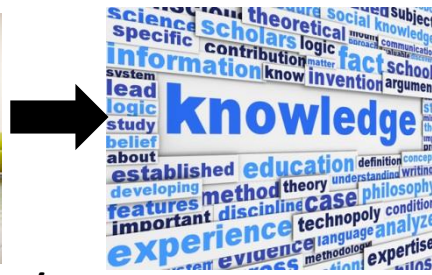
2. Information finding session (library).