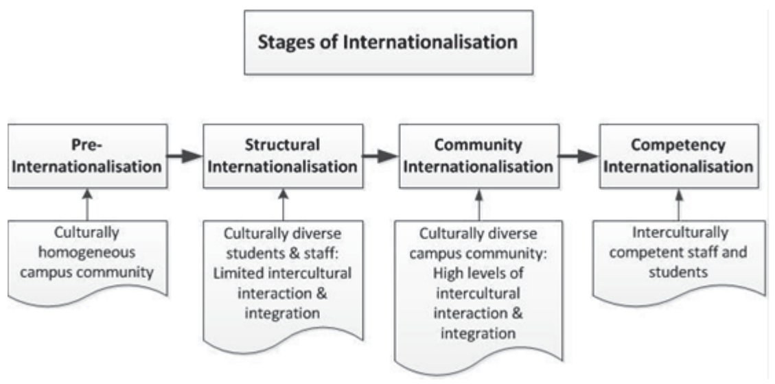
Figure 2: Developmental stages of internationalisation

Source: Spencer-Oatey, H and Dauber, D (2015, p 8)